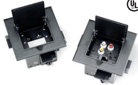
Shown with optional MAAPs